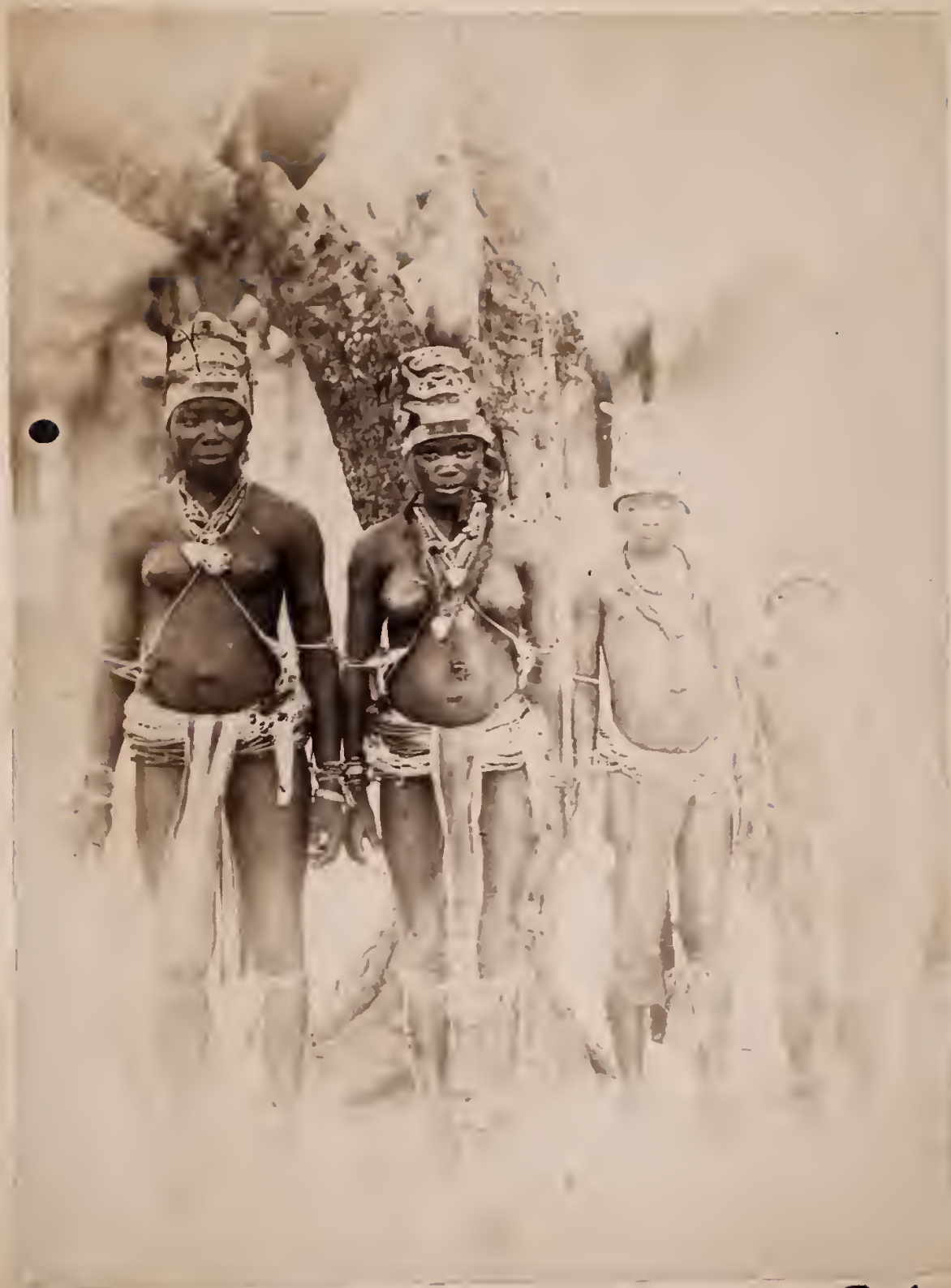
Bulu tribe (Fang). Batanga West Africa.